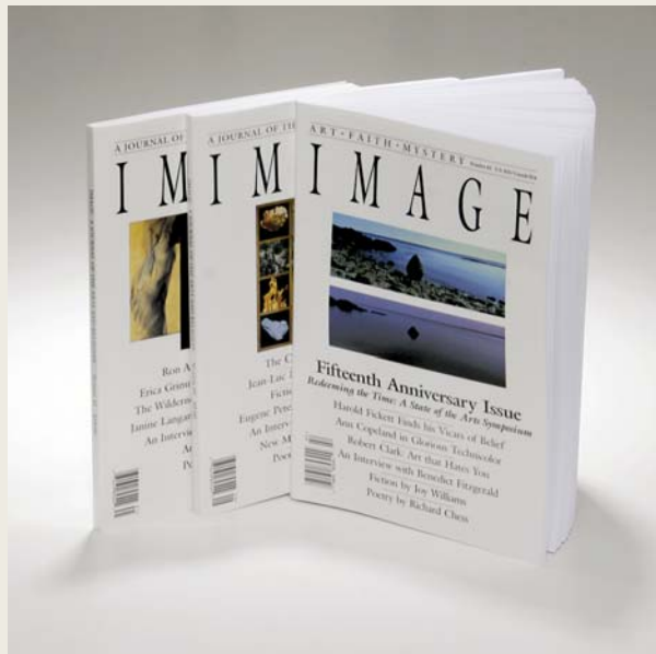
Image is a highly regarded journal in the public square of American culture. At the same time, it has become the foremost source of contemporary art and literature in faith communities.

Image features fiction, poetry, painting, sculpture, architecture, film, music, and dance. Every issue also includes interviews, book reviews, essays, and memoirs. Contributors include not only Pulitzer Prize and National Book Award winners but also a host of young and emerging artists.