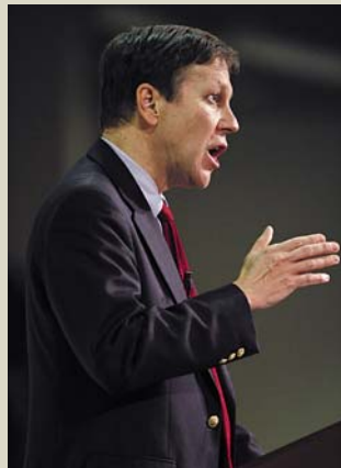
DANA GIOIA, CHAIR OF THE NATIONAL ENDOWMENT FOR THE ARTS, SPEAKS AT THE 2003 IMAGE CONFERENCE