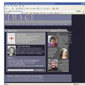
THE IMAGE WEB SITE: WWW.IMAGEJOURNAL.ORG